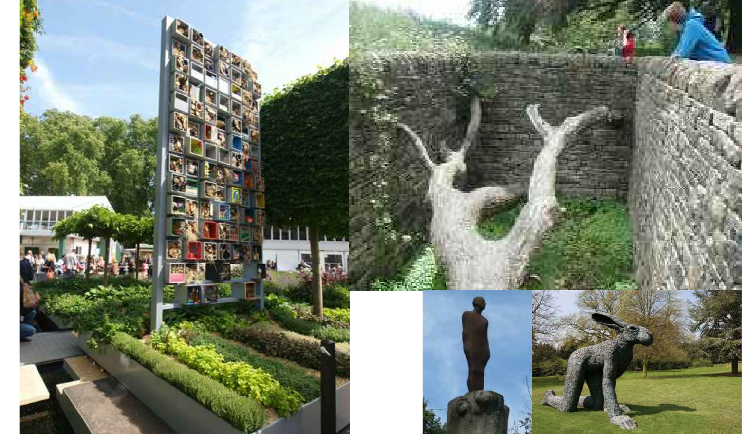
Examples of Public Sculpture Examples of Play Equipment