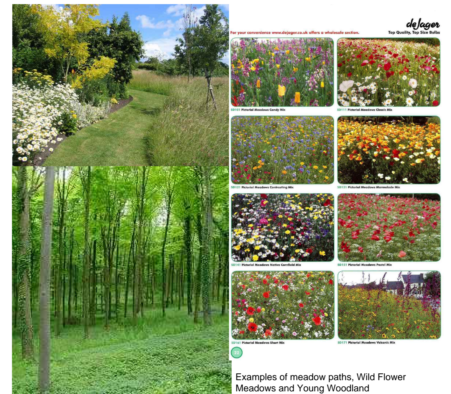
Examples of meadow paths, Wild Flower Meadows and Young Woodland