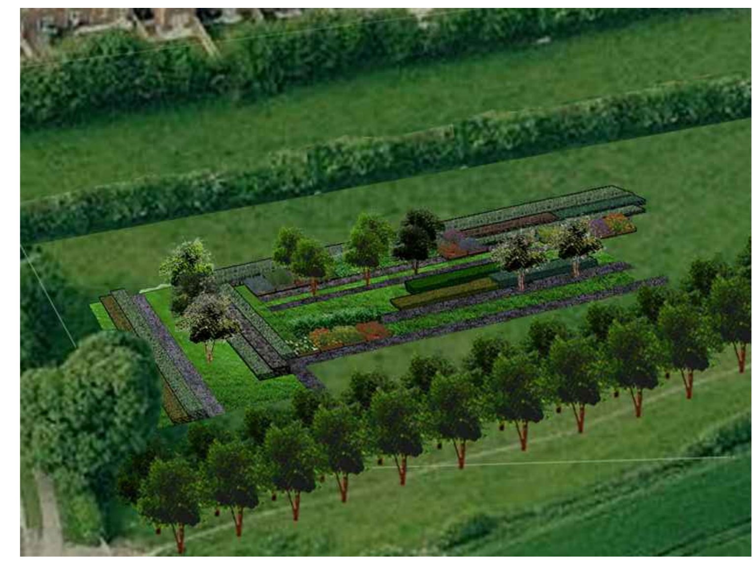
Proposed entrance to Green Park from Austhorpe Lane